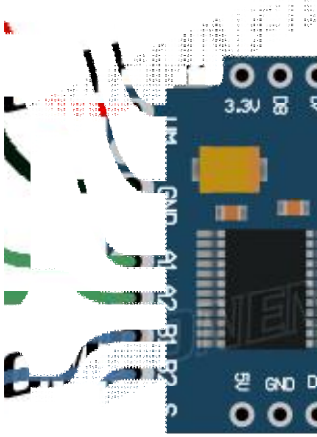
Wemos : module sensor wemos ii : mini pro