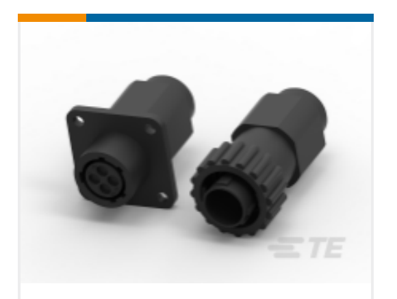
TE Model / Part # CAT-AM71-C83998Y CPC SERIES 1 SEALED ONE-PIECE