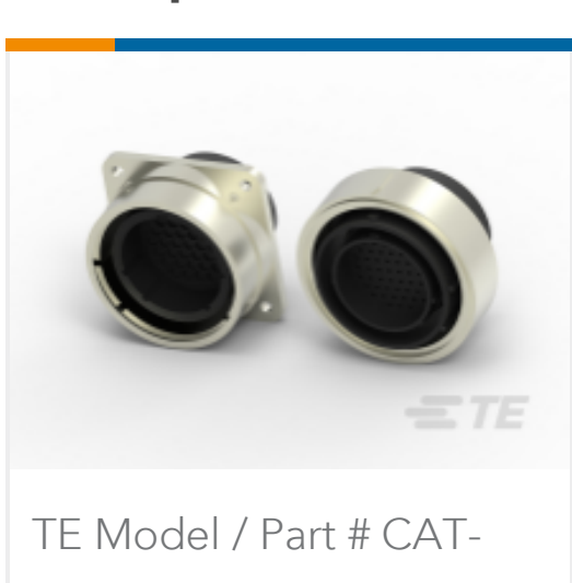
TE Model / Part # CAT-AM71-C83998C CMC SERIES 1