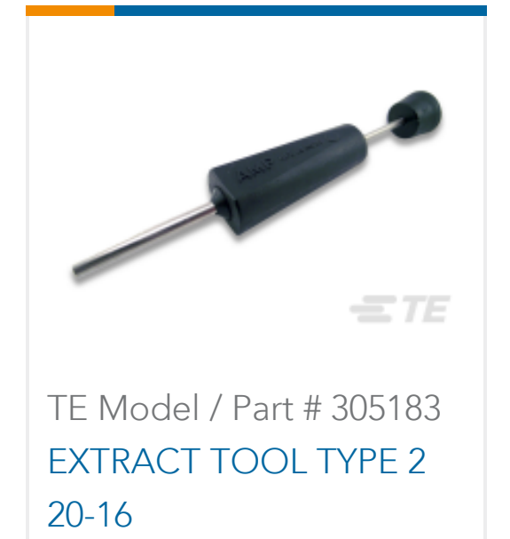
Also in the Series | AMP Type III+