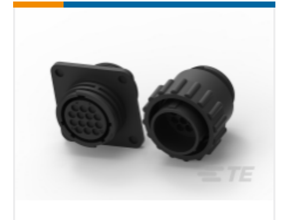
TE Model / Part # CAT-AM71-C83998K CPC SERIES 6