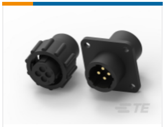
TE Model / Part # CAT-AM71-C83998J CPC SERIES 1