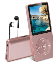
Audio and Video